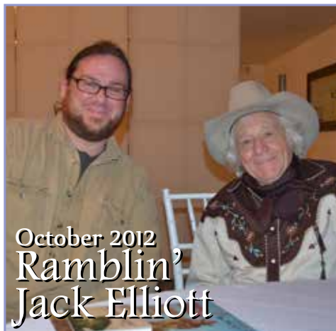
October 2012 Ramblin’ Jack Elliott

We would like to extend our sincere thanks to this year’s Tom Humphrey Guitar Series sponsor, Newburgh Veterinary Hospital.