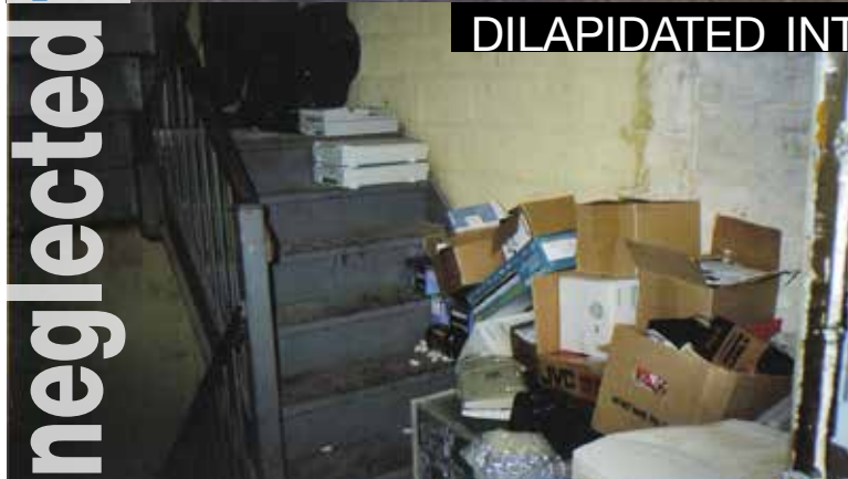
DILAPIDATED INTERIORS IN 2002