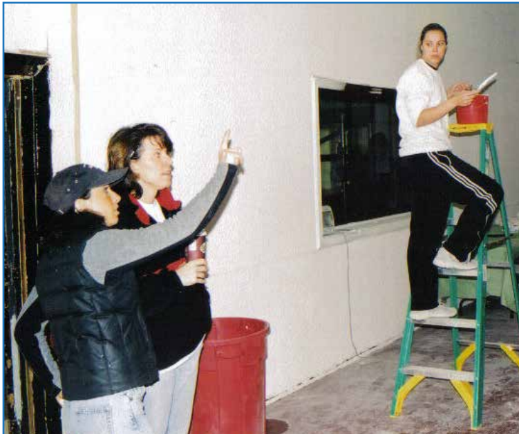
Cleanup and renovations begin in the lobby of the old Hotel Newburgh