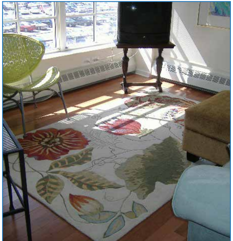
Every room in the former Hotel Newburgh has been transformed and remodeled into beautiful studio apartments for tenants of The Cornerstone Residence