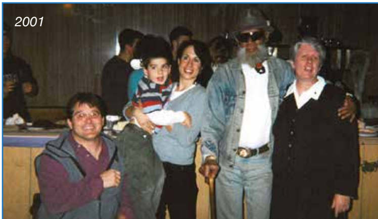
In 2001, before Safe Harbors owned the building we began hosting Thanksgiving Dinner for the residents. That tradition continues today with an annual feast for tenants and members of the community