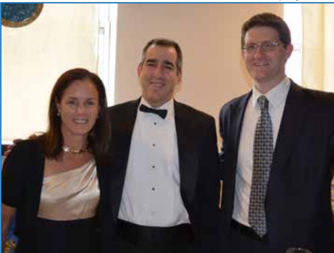
Safe Harbors Gala 2012