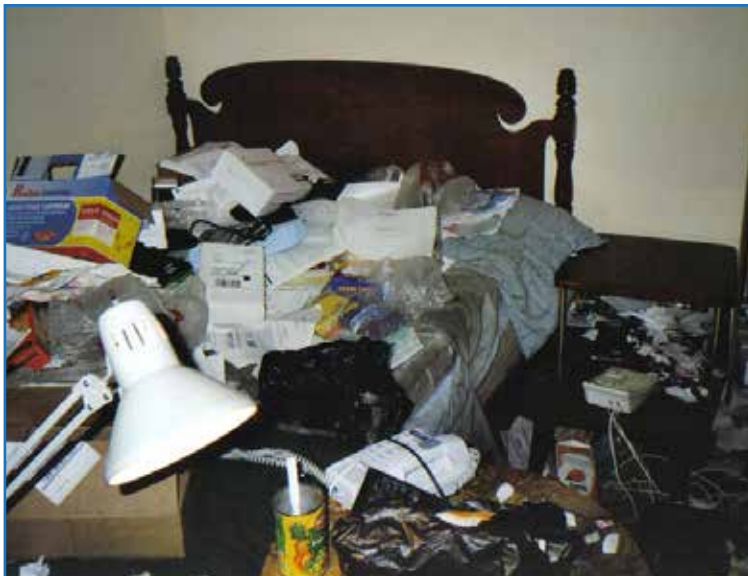
An old Hotel Newburgh room in 2002, before renovations began