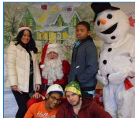
Volunteers from Storm King School