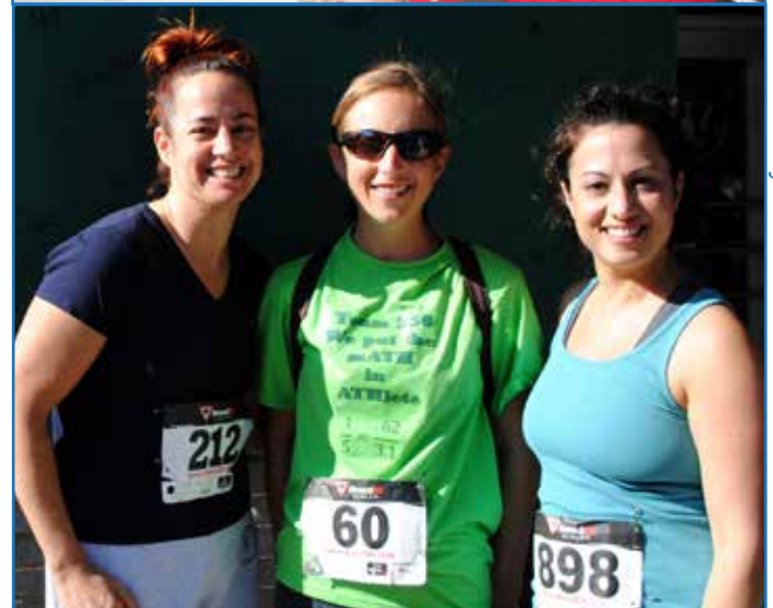
Off Broadway Run 2012