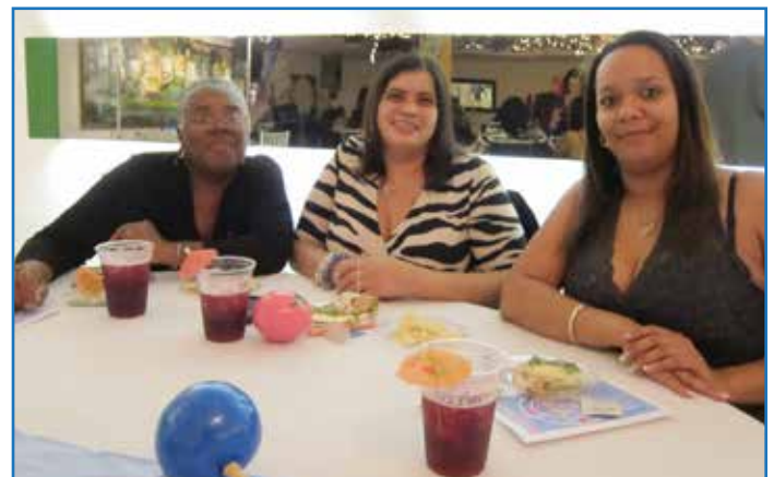
Tenant Gala 2012