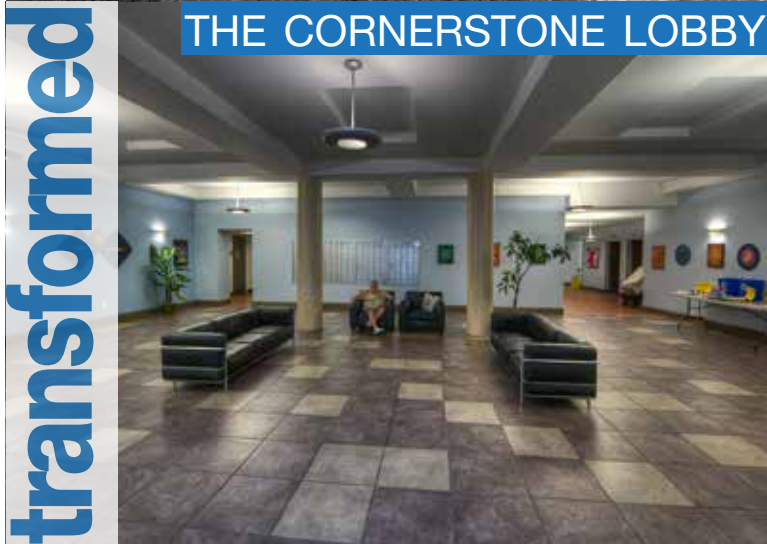
THE CORNERSTONE LOBBY